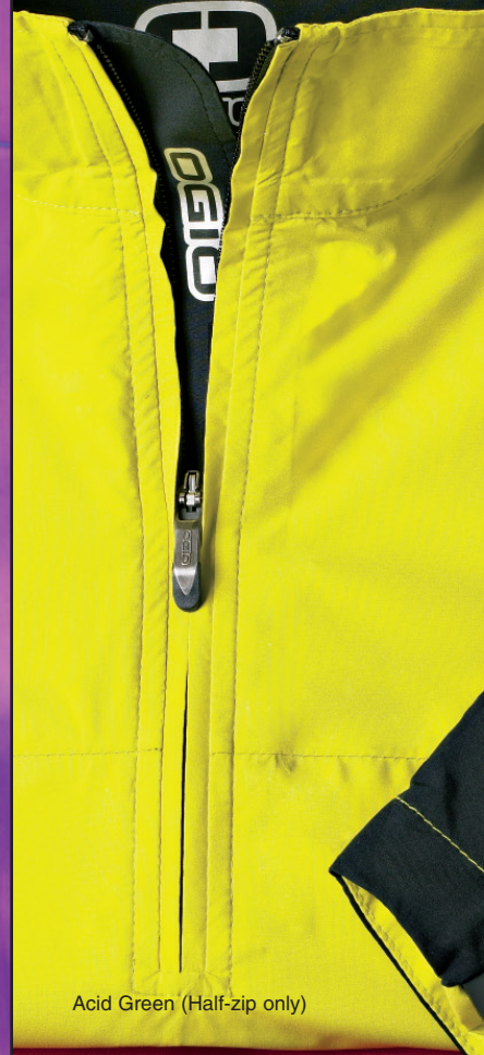
Acid Green (Half-zip only)