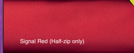
Signal Red (Half-zip only)